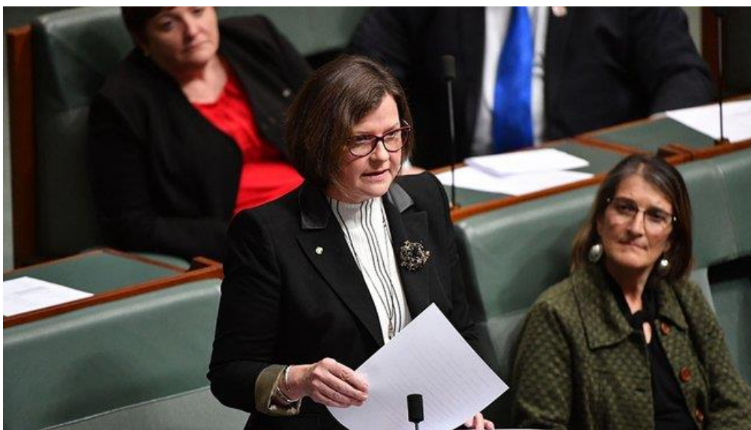
Labor member for Batman Ged Kearney

The Redistribution Committee said it had "received suggestions" which "argued that John Batman was not a worthy individual after whom to name an electoral division, based on an evaluation of his legacy and his historical dealings with Aboriginal communities."