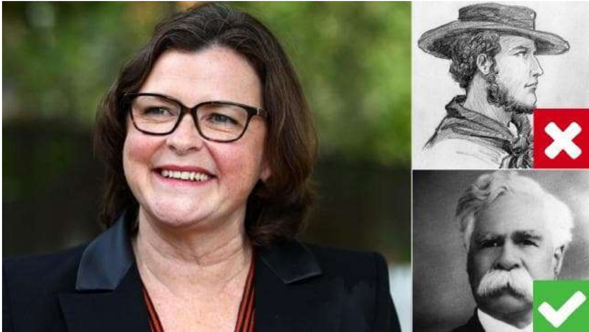
Ged Kearney's seat of Batman has been renamed. Early settler John Batman (top right) has been dropped for indigenous activist William Cooper (bottom right).